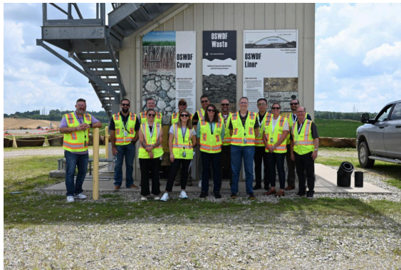
Ohio Nuclear Development Authority members pose for a photo at the Portsmouth Site On-Site Waste Disposal Facility during a recent tour.

The board seeks to foster innovative partnerships in the state — including Ohio's public institutions of higher education, private companies, federal laboratories and nonprofit organizations — to accomplish those goals.