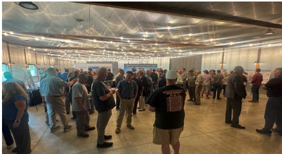
Pike County Meet the Developers Open House, June 10, 2025

The Southern Ohio Diversification Initiative (SODI) and Ohio University's Voinovich School PORTSfuture Program hosted Meet the Developers Open House events on June 10 in Pike County and June 11 in Scioto County.