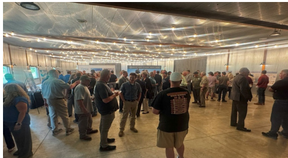
Pike County Meet the Developers Open House, June 10, 2025

The Southern Ohio Diversification Initiative (SODI) and Ohio University's Voinovich School PORTSfuture Program hosted Meet the Developers Open House events on June 10 in Pike County and June 11 in Scioto County.