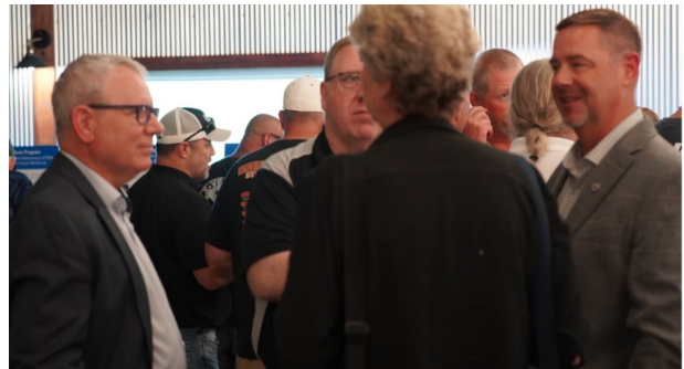
Labor leaders attend Pike County Meet the Developers Open House, June 10, 2025

PORTSfuture and SODI highlighted their collaborative work on site reindustrialization and workforce readiness. Over 240 community members and other site stakeholders engaged directly with the developers to learn about the projects, job projections, ask questions, and share comments.