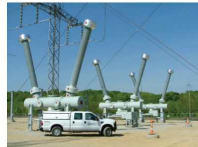
Don Marquis Substation, 800-kV Circuit Breaker's